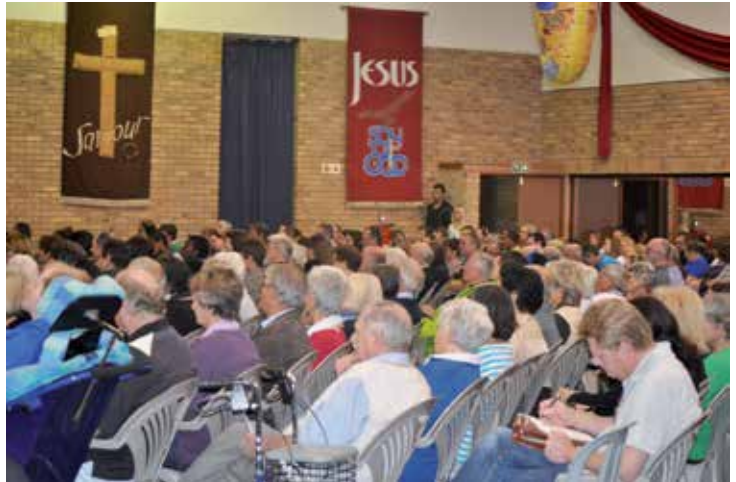
Full house at Fish Hoek

In spite of the overthrow of the apartheid regime in 1994, South Africa faces enormous social problems. Last November, the Daily