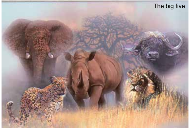
The big five