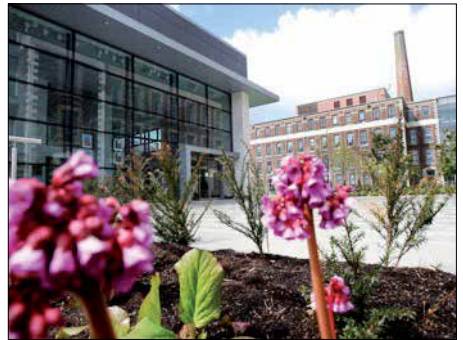
Theatre at the Mill

The next three days were jointly arranged by Trinity Reformed Presbyterian Church, Newtownabbey , and Reformed Presbyterian Church, Carrickfergus . The first event was at the brilliant Theatre at the Mill, Newtownabbey. The 400 seats were all booked weeks beforehand, so I was asked to add a ‘matinée’ at 6.00pm. This gave two great opportunities to speak on ‘Where is God when things go wrong?’, and there was excellent interaction after both sessions — and another heavy raid on the book tables.